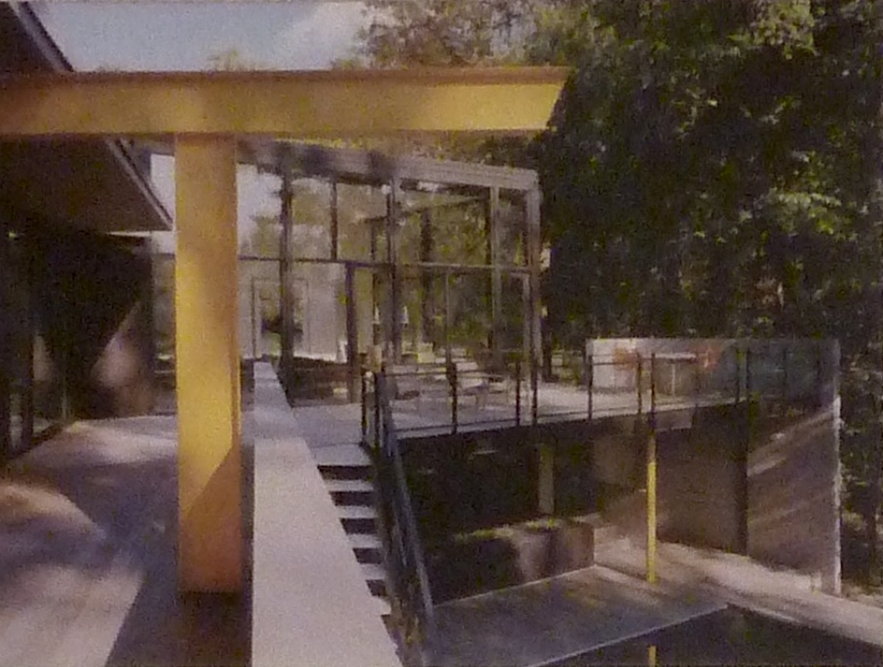
Hochlander Davis Photography